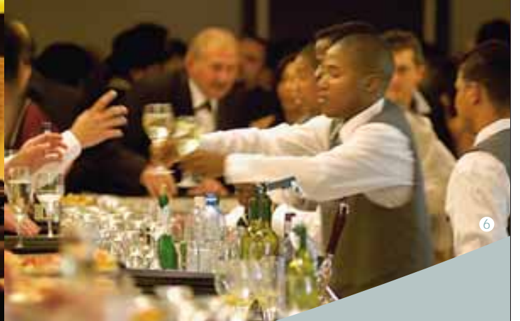
1. Conservatory 2. Ballroom